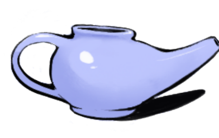
Neti pot or Sinus rinse bottle